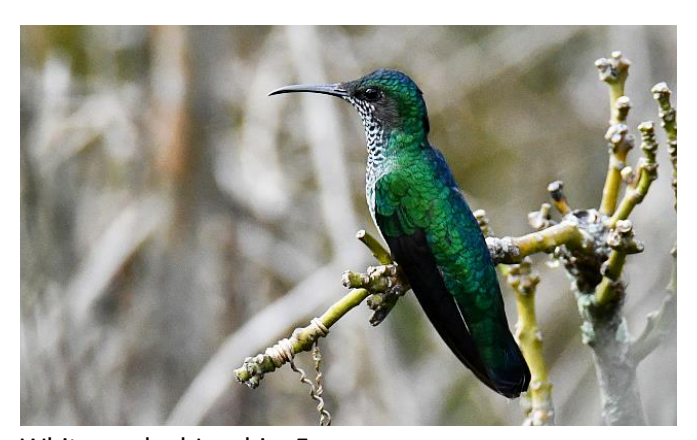
White-necked Jacobin F