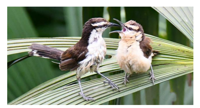
Bicolored Wren feeding young