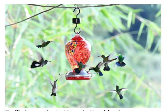
Traffic jam at the La Veranda Hotel feeders