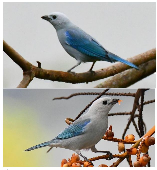
Blue-gray Tanager (Subspecies west of Andes lack white on wings.)