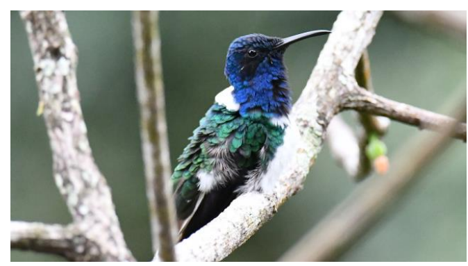
White-necked Jacobin M