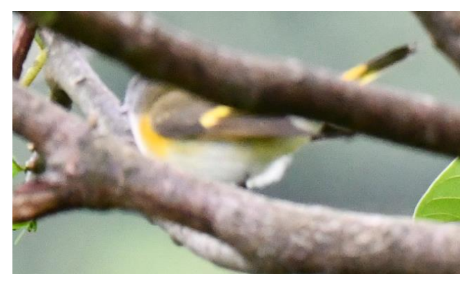
American Redstart F