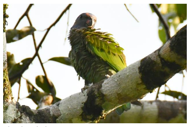
Blue-headed Parrot preening