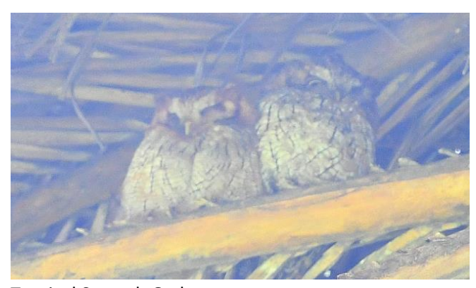
Tropical Screech Owl