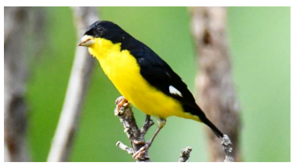
Lesser Goldfinch M