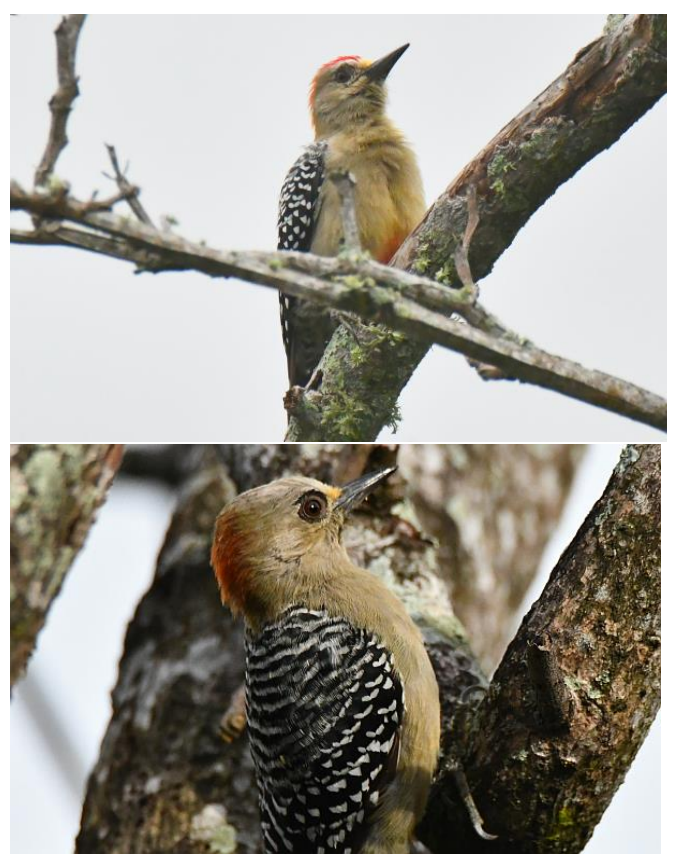
Red-Crowned Woodpecker MF