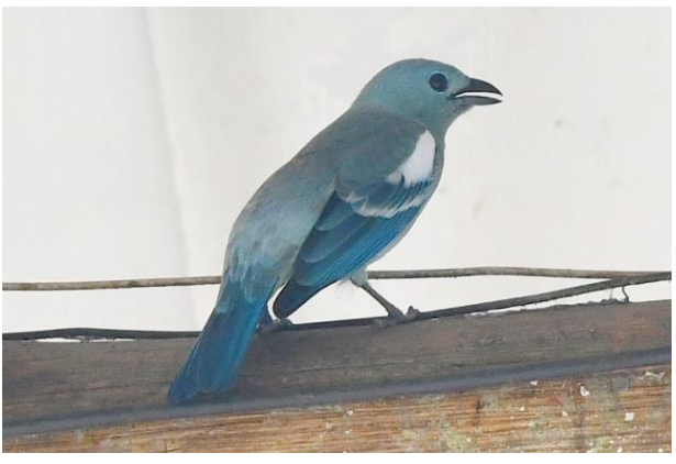
Blue-gray Tanager (Subspecies east of the Andes have white wing bands.)