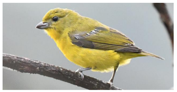
Thick-billed Euphonia F